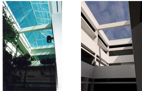
Fig. 2: A CGM image versus an actual photograph. [10]

According to Kaufman and Howard [11] in their illuminance values for general types of activities in interiors, the range of illuminance measurements for any specific tasks was always in a ratio of 1:2. Example: simple orientation for short temporary visits is five to ten footcandles of general lighting throughout the space. This was almost the same range provided from Lightscape’s illuminance data recorded when compared to the actual space.