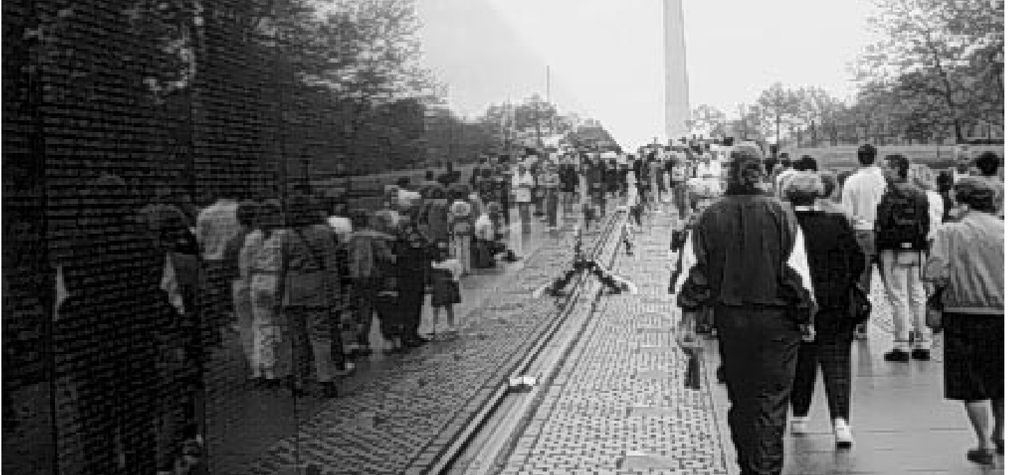
View of the Washington Monument from deep inside the Viet Nam Memorial.