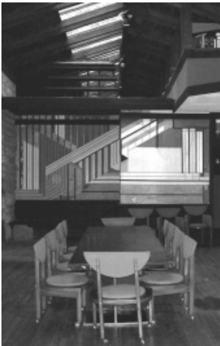
Roberts room 1—our meeting room at Hillside