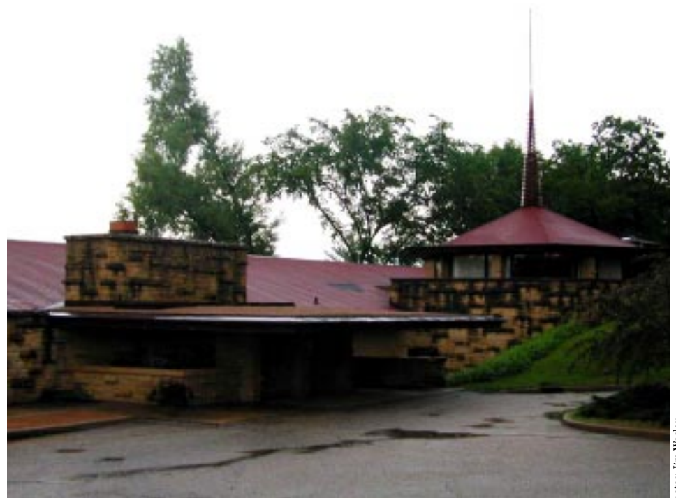
The Visitor's Center at Taliesin will host SBSE's retreat dining.