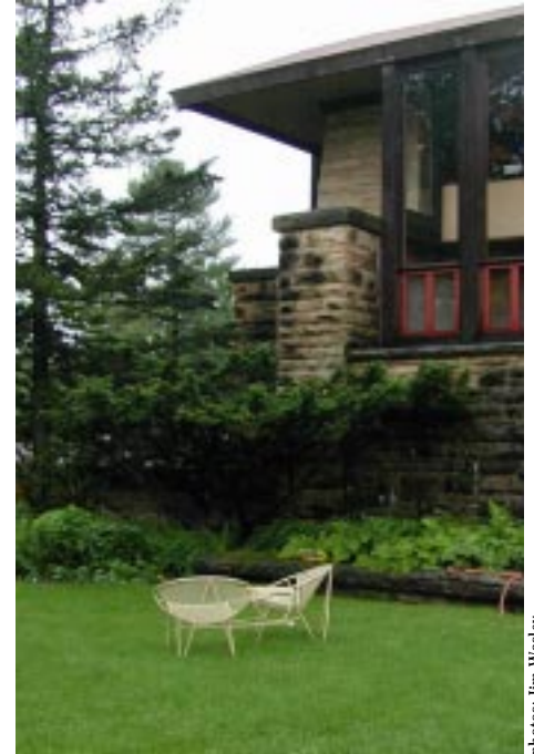
Lawn chairs at Hillside should support retreat objectives.