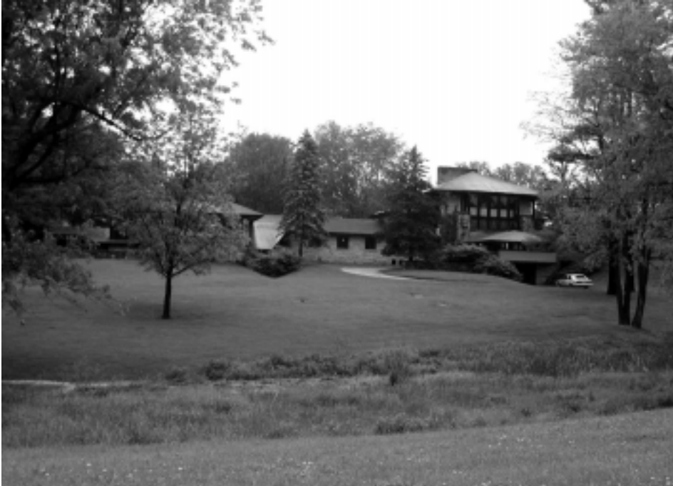
Hilltop School, home for our summer retreat, as seen from the road. We're staying at Hilltop, working at Hillside, and eating at the Visitor's Center.